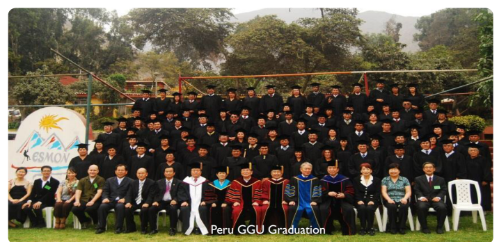
Peru GGU Graduation