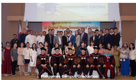
Philippines Campus Graduation