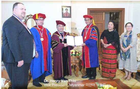
Dr. Henry Van Thio Vice President, Myanmar 미얀마 부통령

Global Gateway University 는 세계 선교현장의 교육개발 및 지도력 개발을 통해 미래를 이끌어갈 역동적인 리더를 양성하는 대학교 입니다.