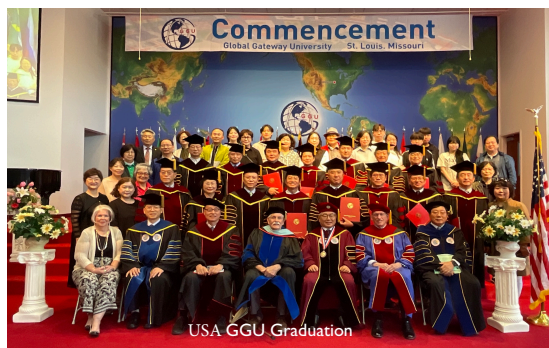
USA GGU Graduation