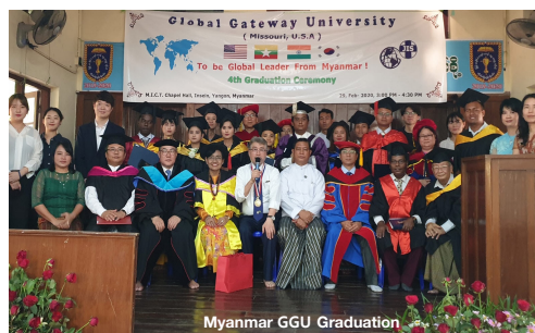
Myanmar GGU Graduation